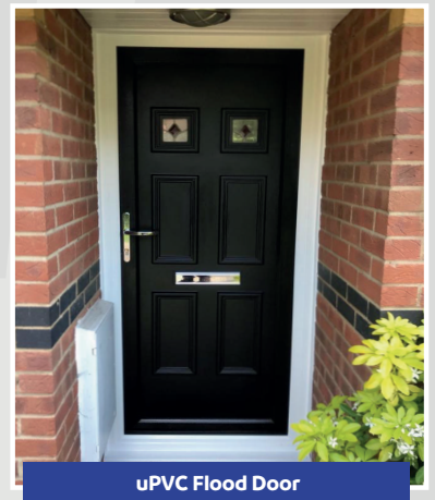
uPVC Flood Door