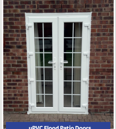
uPVC Flood Patio Doors