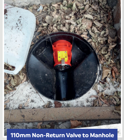
110mm Non-Return Valve to Manhole