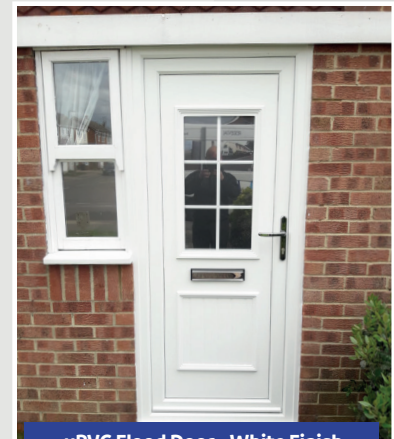
uPVC Flood Door - White Finish