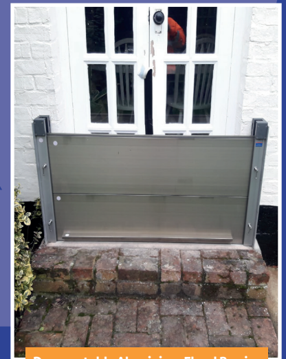
Demountable Aluminium Flood Barrier